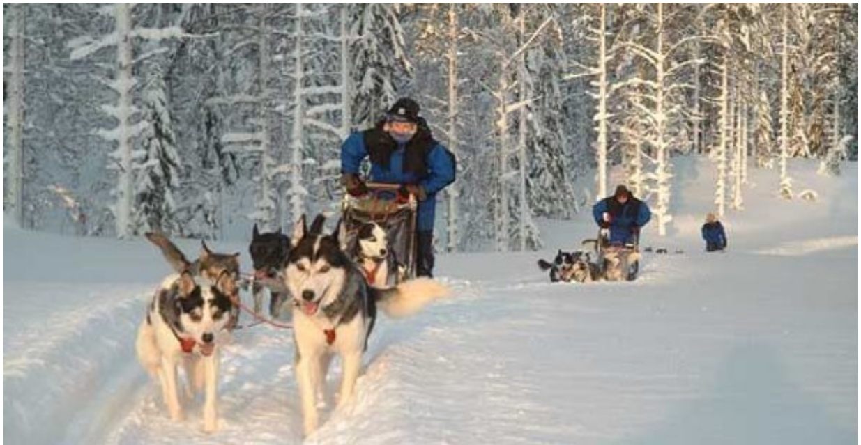
Husky Day Tour (sharing a sled – add £55 per person for own sled) Full husky safari with lunch round an open fire. 4 to 5 hrs, 25 to 35km. £185