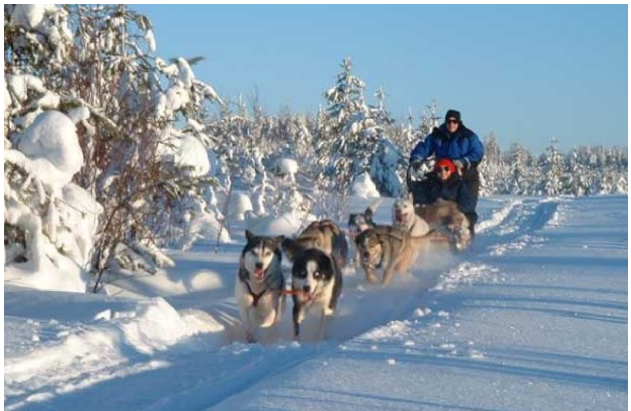
Husky 'Coffee Safari' (sharing a sled – add £55 per person for own sled) Short tour for around 2 hours approximately 15km. Coffee after the trip. £135